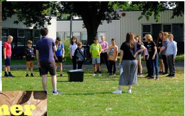
@ConkersCentre fun today with new Y7s for Summer School @AlcesterAcademy Adobe Spark